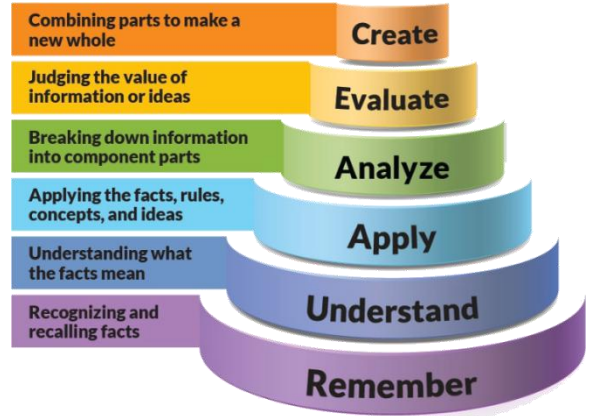
Figure 1: Blooms Taxonomy

(Blooms taxonomy has been given for reference)